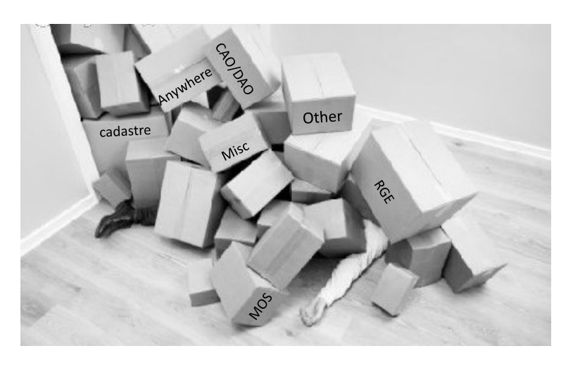
The number of data has exploded