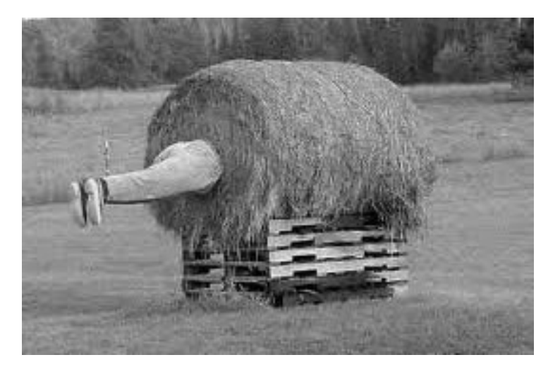
it's getting worse...